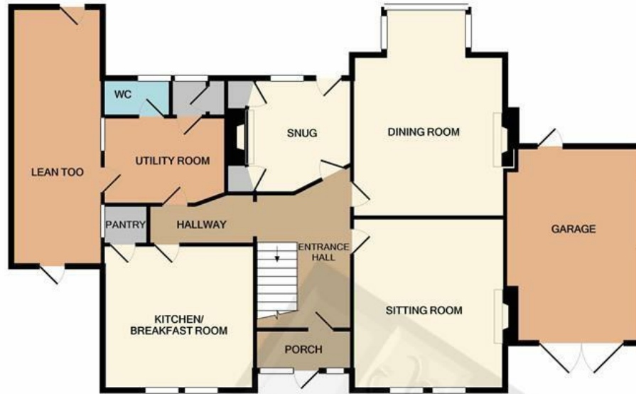
GROUND FLOOR APPROX. FLOOR AREA 1225 SQ.FT. (113.8 SQ.M.)