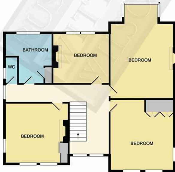
1ST FLOOR APPROX. FLOOR AREA 902 SQ.FT. (83.8 SQ.M.)

TOTAL APPROX. FLOOR AREA 2127 SQ.FT. (197.6 SQ.M.)