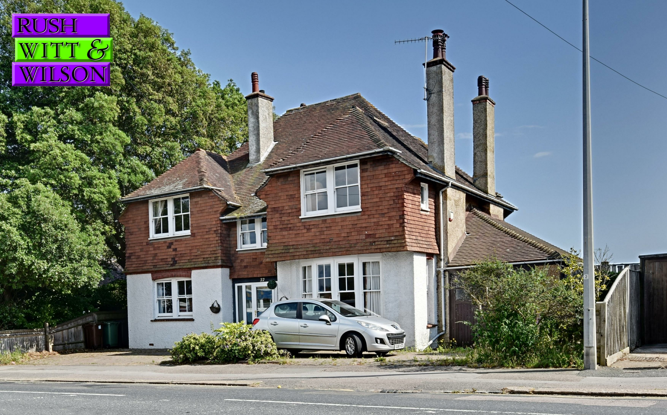
22 Terminus Road, Bexhill-On-Sea, East Sussex TN39 3LR £539,000